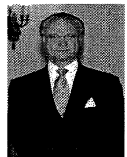
H.M the King, Carl XVI Gustaf of Sweden