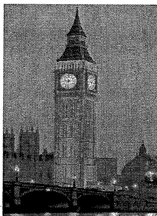
Big Ben Tower in London, one of the stops on the tour.