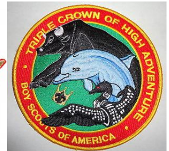
BSA Triple Crown Hi Ad