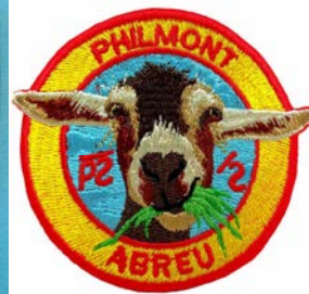
Back Country Camp