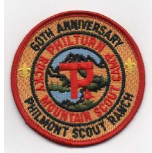
60 th Anniversary