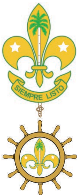
1940's Membership Badge

The Asociación de Scouts de Cuba (ASC, Scout Association of Cuba ) was the national Scouting organization of Cuba from 1927 to 1961. Scouting in Cuba started in 1914, in 1927 the ASC was founded and became a member of the World Organization of the Scout Movement the same year and was suspended from WOSM membership in 1961. At the end of the 1950s, the boys-only association had about 6,500 members. The first troops of Boy Scouts in Cuba met under the sponsorship of the American Legion, the Mother's Club del Vedado and the electric generating plant of the Compañía Cubana de Electricidad . During its first years, Cuban Scouting followed the model of the Boy Scouts of America, using the uniform, Boy Scout Handbook and many of their practices. Scouting existed in Cuba itself until the 1960s, when Cuban Scouting ceased operations after the Cuban revolution of 1959. Cuban Scouts rendered service during those times, directing traffic, collecting rations, helping in hospitals and establishing first aid stations. In 1961, the World Scout Conference terminated the WOSM membership claiming that the ASC had ceased to exist. In hopes of Scouting's eventual return, Cuban-American Scouts of the Boy Scouts of America are instrumental in annual Lincoln-Martí celebrations in Miami, Florida.