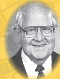
THE CLIFF DOCHTERMAN AWARD

IFSR's Premier Recognition Award for Rotarians